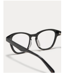
HORN GOLD HORN