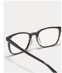
DKTO DARK TORTOISE