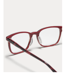
CTAR CREAM TORTOISE/ ACTIVE RED