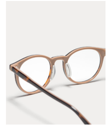
CLAY CLAY TORTOISE